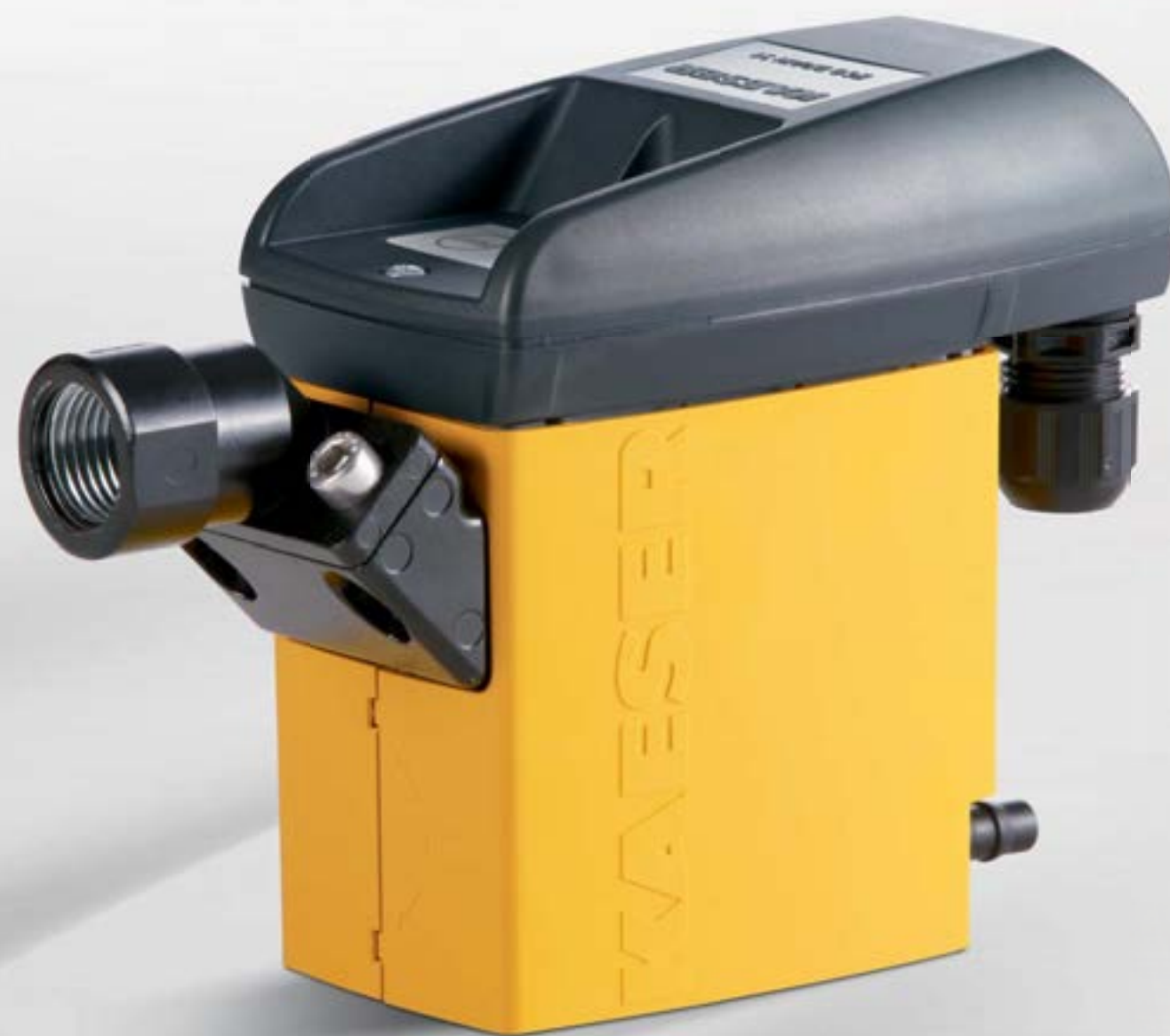
Image: ECO-DRAIN 31