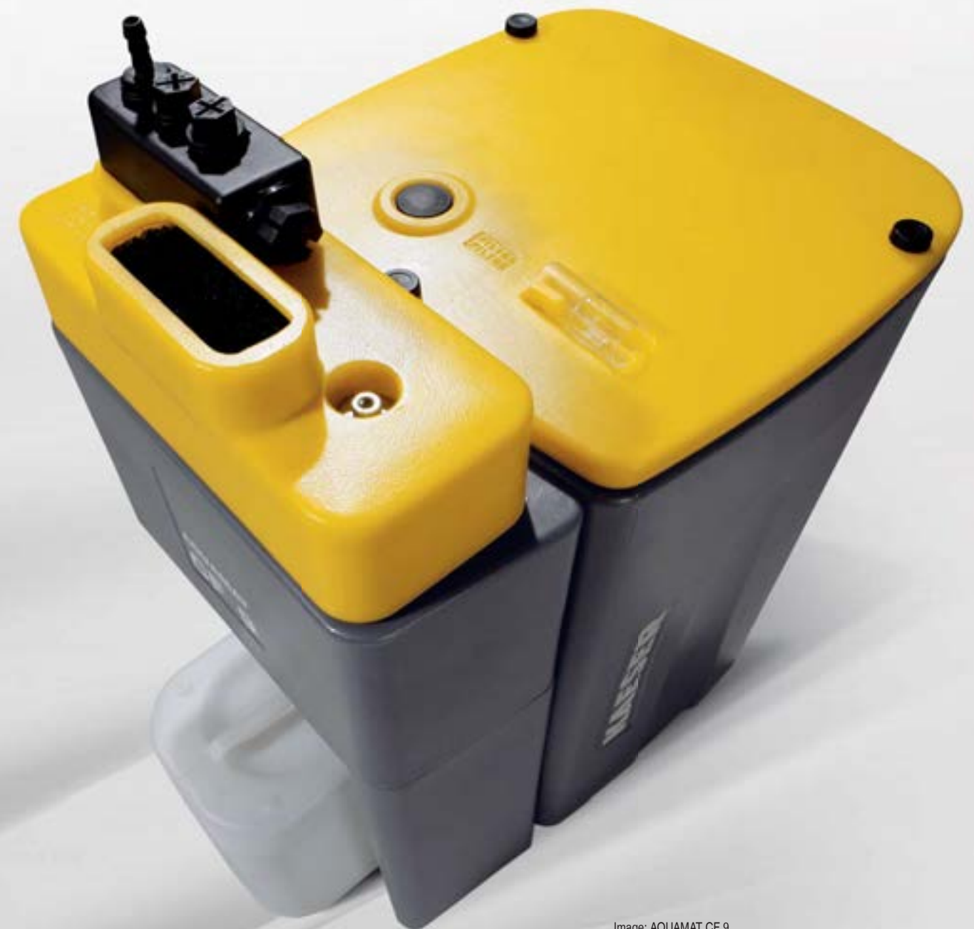
Image: AQUAMAT CF 9