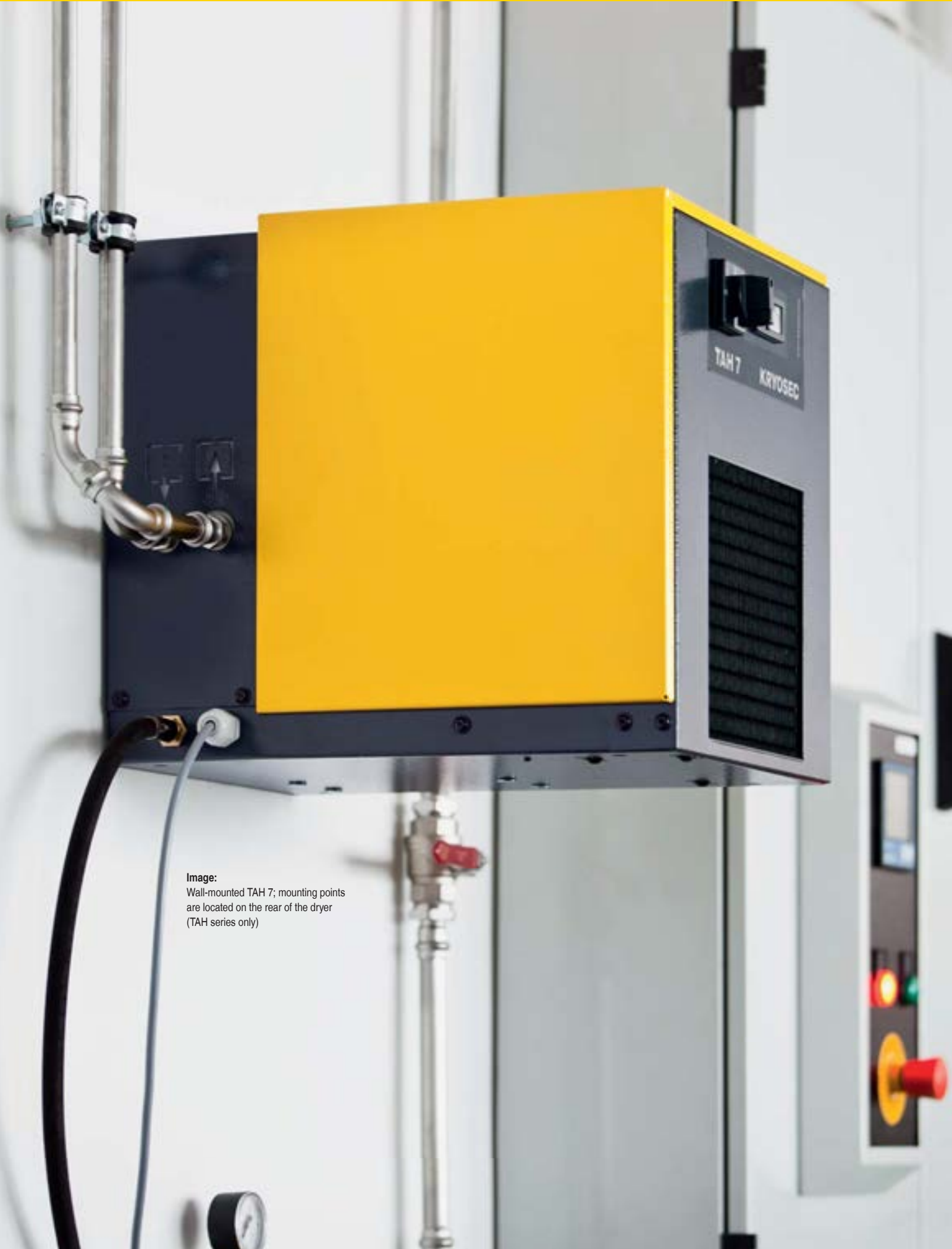
Image: Wall-mounted TAH 7; mounting points are located on the rear of the dryer (TAH series only)