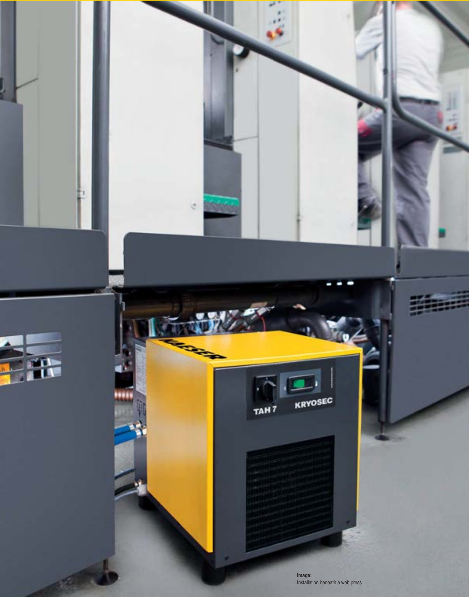
Image: Installation beneath a web press